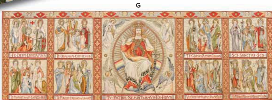
Card G: The Te Deum Altar Frontal (total dimensions 120 x 360mm, twice folded to size 120 x 120mm)

Mail Order form overleaf. All items also for sale at: The Friends' Office, 52 The Close, Salisbury SP1 2EL (during office hours, excluding Mondays) and Christmas Cards in the Cathedral Shop