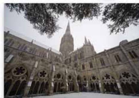
Christmas Card D: Snow in the Cloisters (dimensions 148.5 x 105mm)

The greeting inside cards A, B, C and D is: